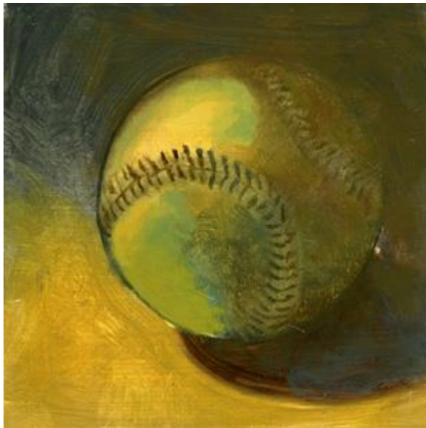
detail of brushstrokes