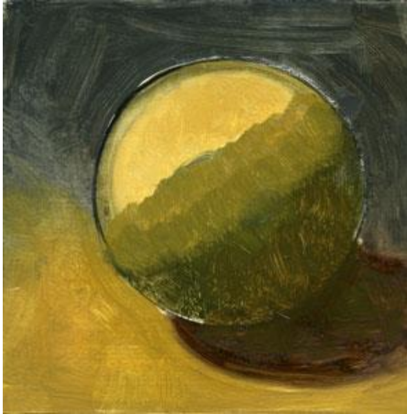
Detail of secondary plane brushstrokes